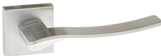
Finish Photographed: Satin Chrome